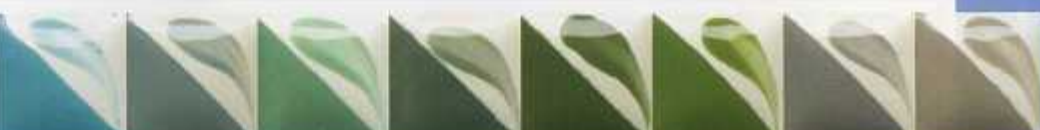
CN 302 Bright Caribbean CN 152 Bright Blue Spruce CN 272 Bright Jade CN 162 Bright Wintergreen CN 172 Bright Kelp