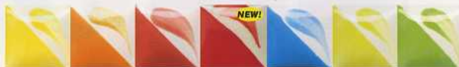
CN 501 Neon Yellow CN 504 Neon Orange CN 506 Neon Coral CN 507 Neon Red CN 502 Neon Blue CN 503 Neon Chartreuse CN 505 Neon Green

Bright color brings fun visual impact to designs. Available in 2-oz. & 8-oz.