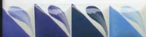
CN 112 Bright Delft CN 122 Bright Nautical CN 132 Bright Tidepool CN 142 Bright Aqua