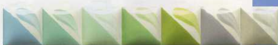
CN 151 Light Blue Spruce CN 271 Light Jade CN 161 Light Wintergreen CN 171 Light Kelp CN 181 Light Kiwi CN 201 Light Grey